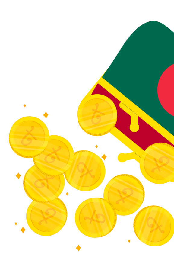
CMSME Establishments and Total Person Engaged by Categories

Since FY16, real GDP has grown at an annual rate of more than 7.0 percent on average. Because of the COVID-19 pandemic, growth slowed to 5.24 percent in FY20, down from 8.15 percent in FY19. It was, nonetheless, among the top five fastest-growing emerging economies (World Bank, 2019). The manufacturing sector, which includes cottage, micro, small, and medium-sized businesses, accounted for most of the growth (CMSMEs). The manufacturing sector grew at a 14.70 percent annual rate in FY19 (BB, 2019-20), making it the most important contributor to the growth of the Industry sector. Almost 7.8 million CMSMEs in Bangladesh contribute to 25% of Bangladesh's GDP, 11 percent of total industrial establishment, 30 percent of total industrial employment and 40 percent of total manufacturing output (ADB, 2015; BBS, 2013). [2]